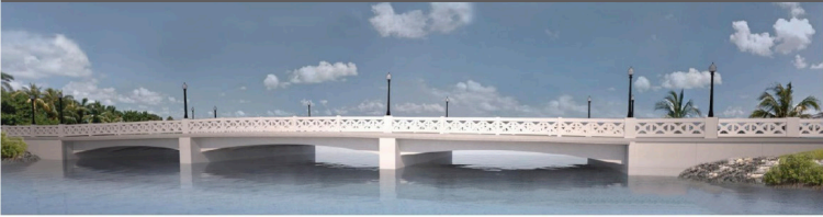
Fixed Bridge Alternative 7 - Arched Beams