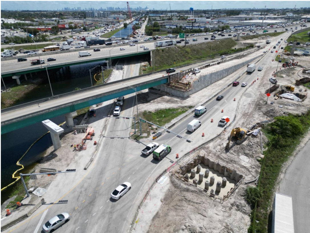
NW 79 Avenue Bridge