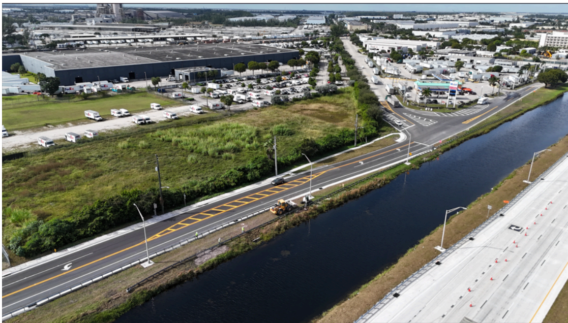
FRONTAGE ROAD AND OKEECHOBEE ROAD