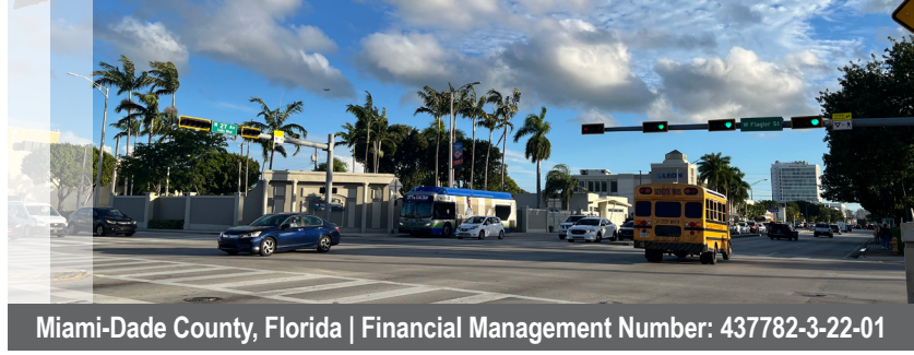
Miami-Dade County, Florida | Financial Management Number: 437782-3-22-01