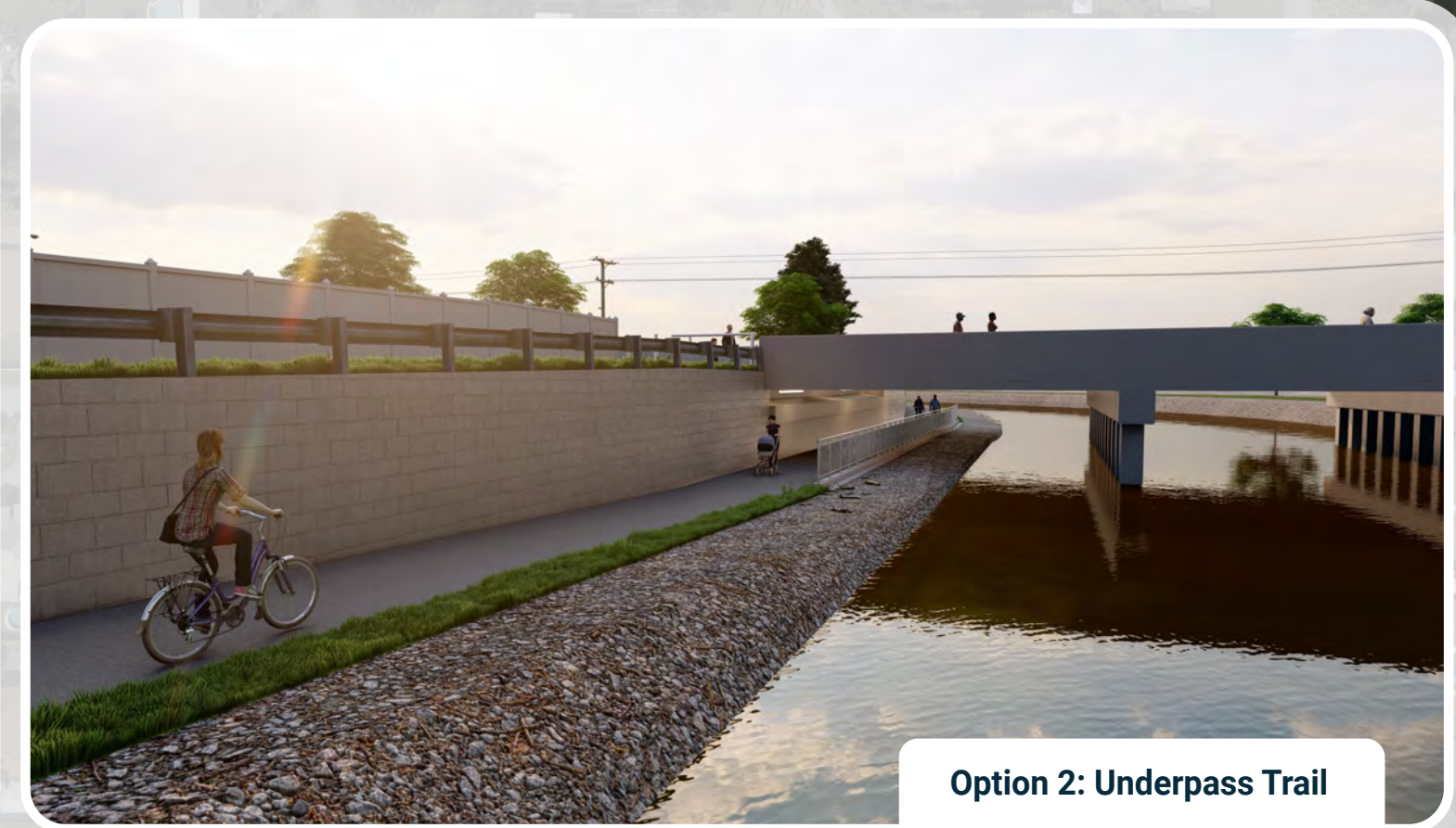
Option 2: Underpass Trail