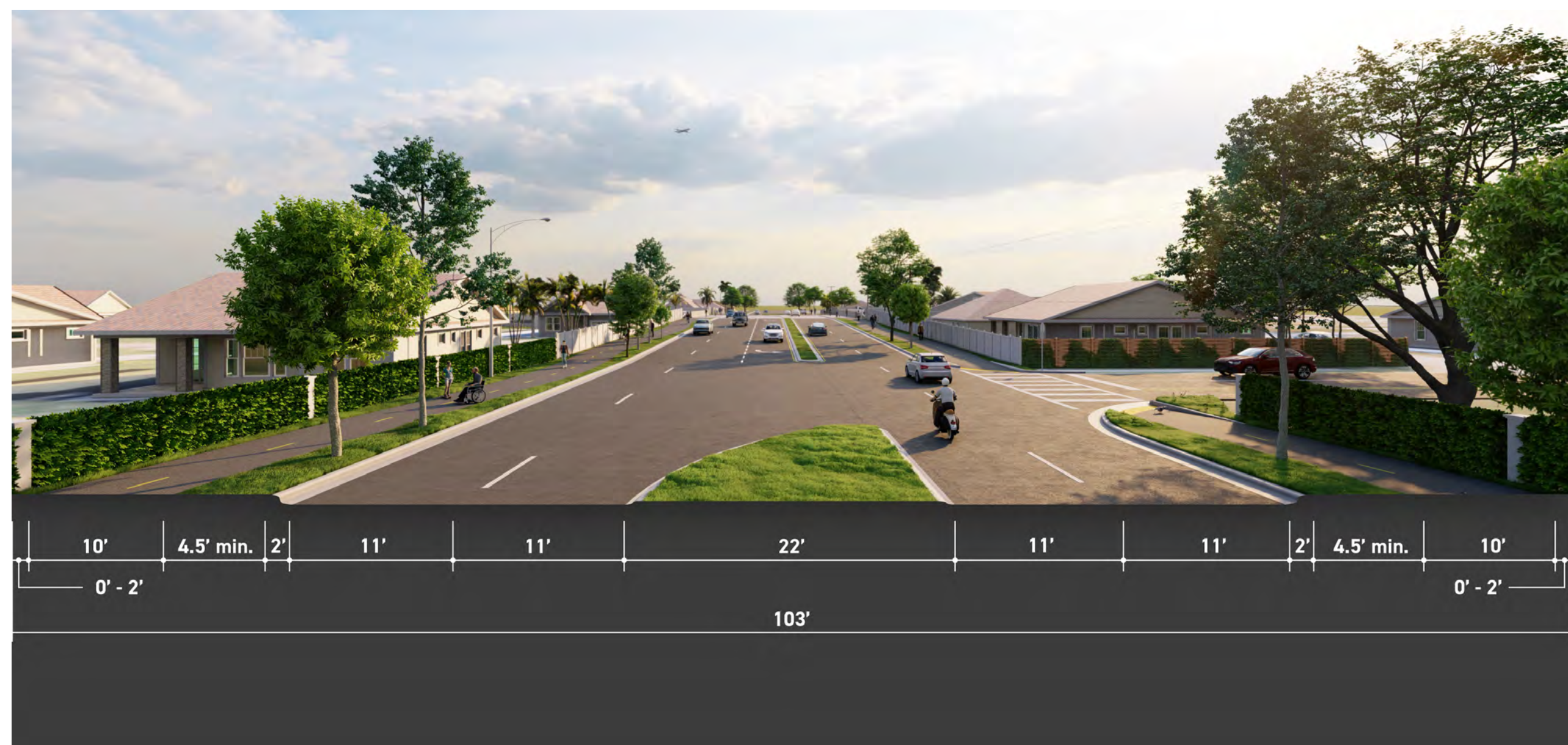
ROADWAY TYPICAL SECTION