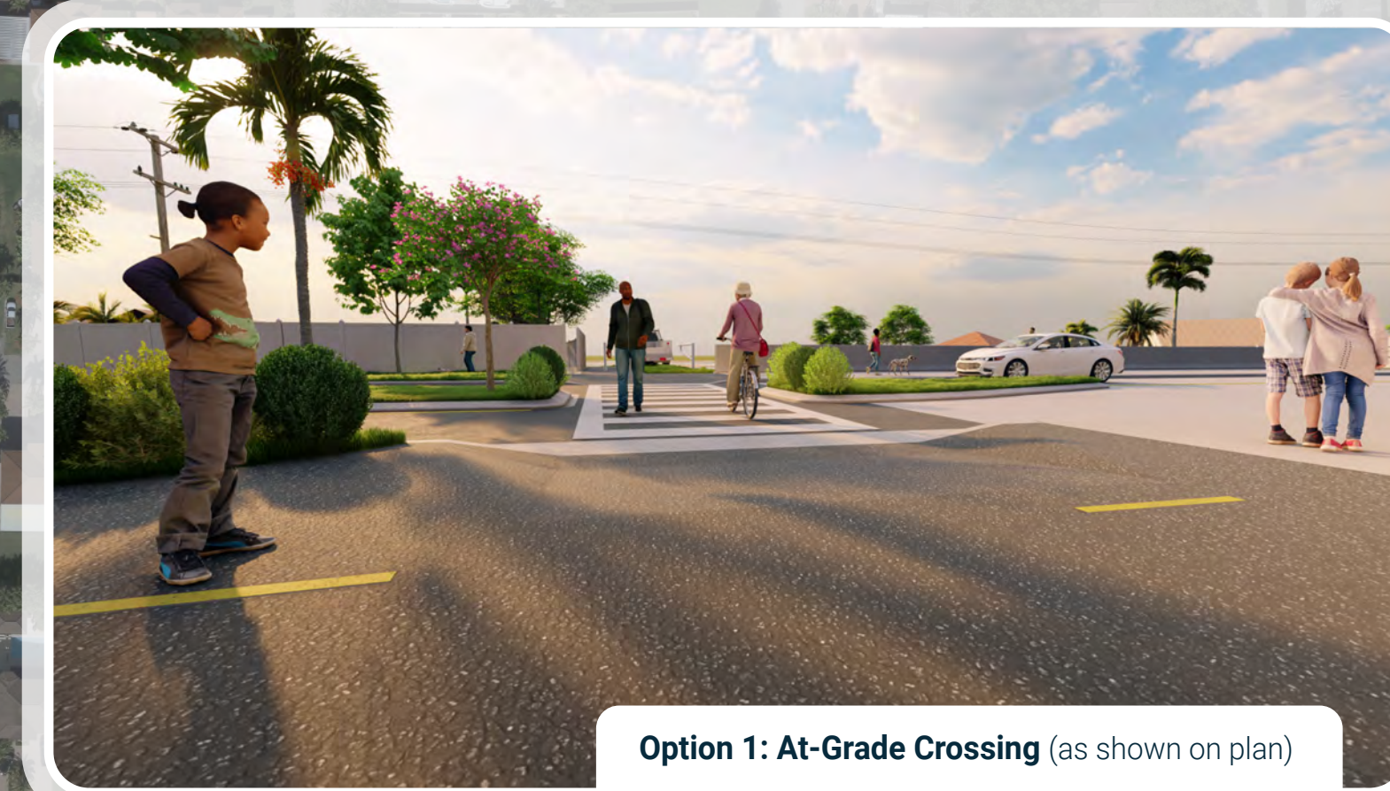
Option 1: At-Grade Crossing (as shown on plan)