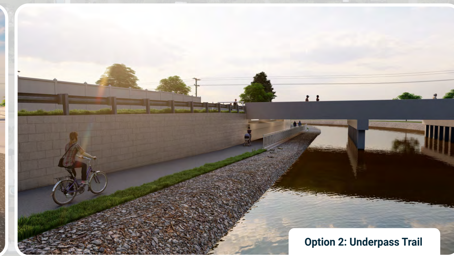
Option 2: Underpass Trail