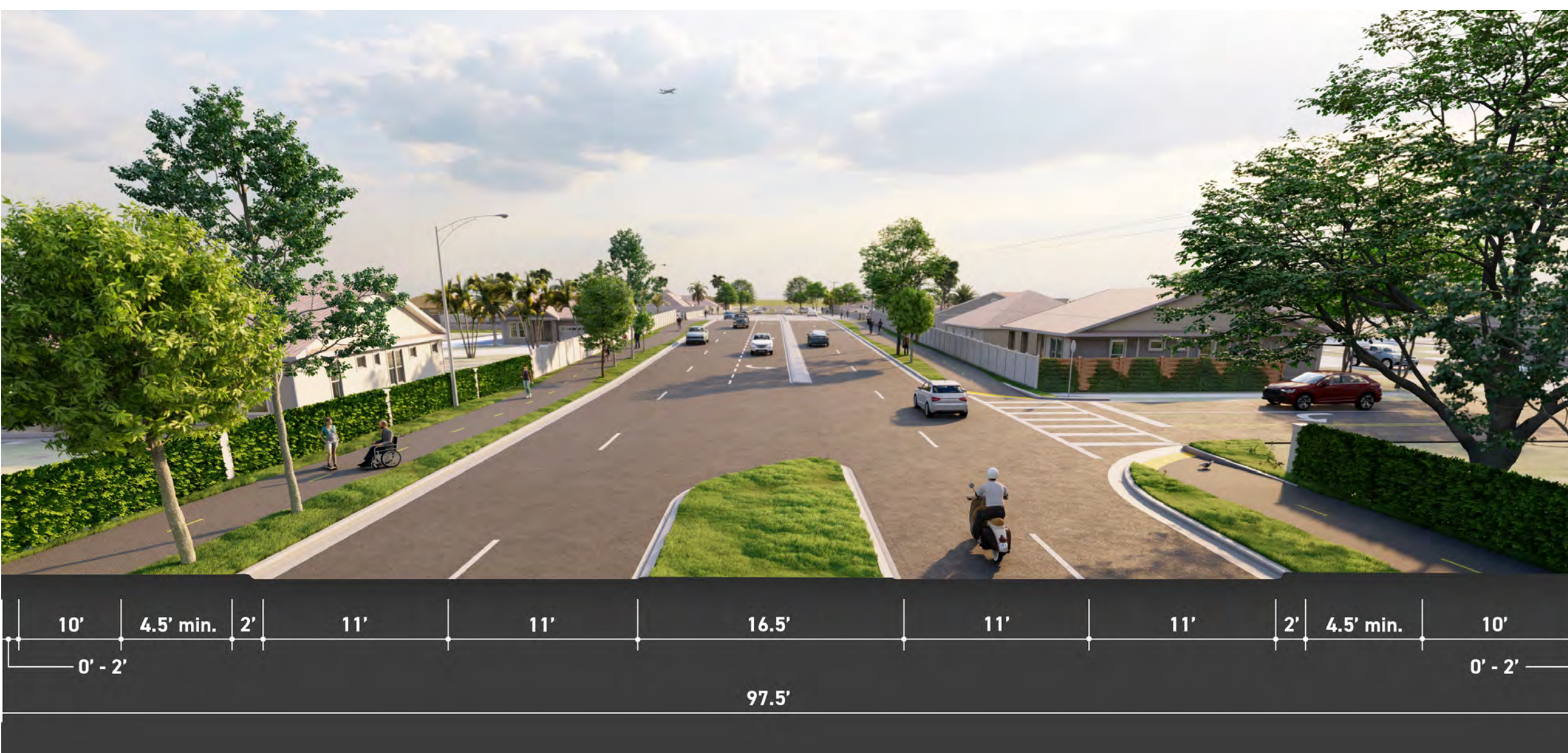
ROADWAY TYPICAL SECTION