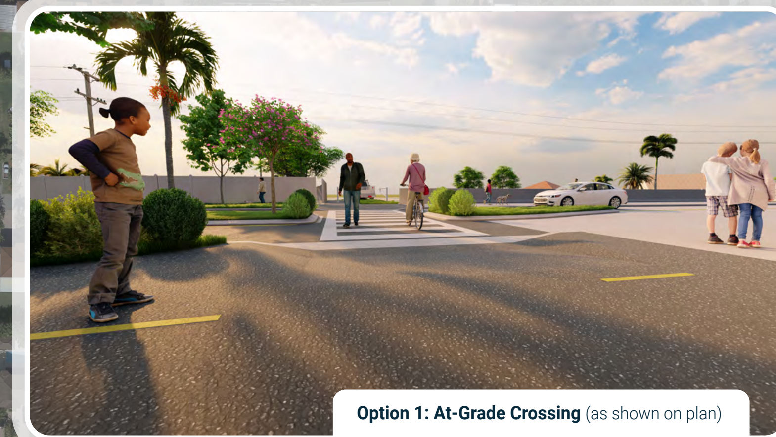
Option 1: At-Grade Crossing (as shown on plan)