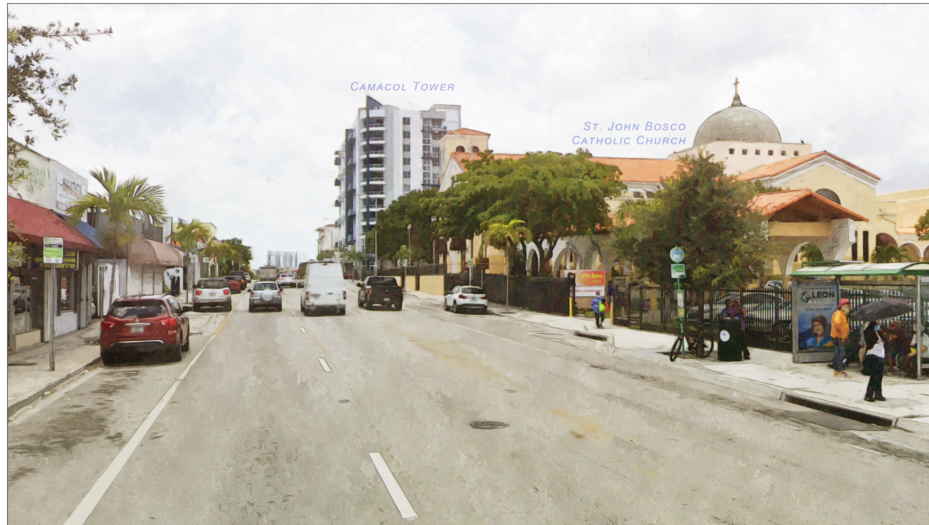
Flagler Street Existing