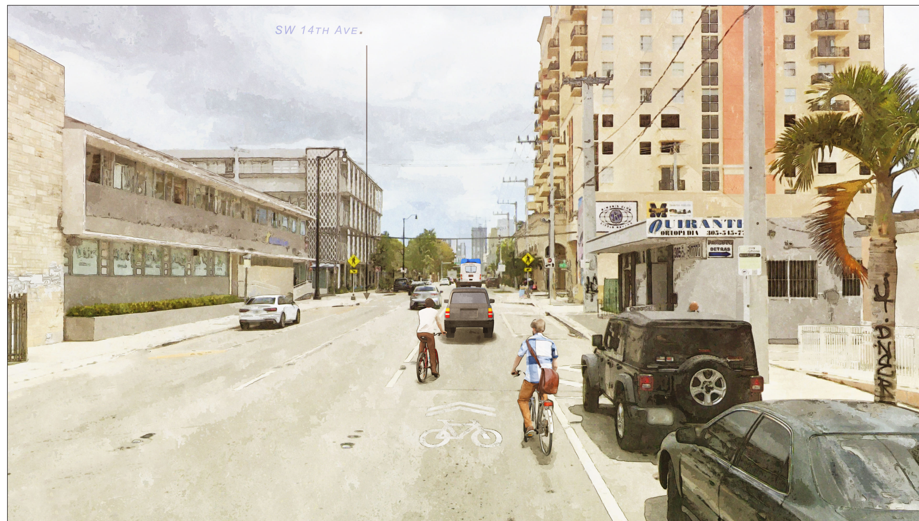
SW 1st Street Existing