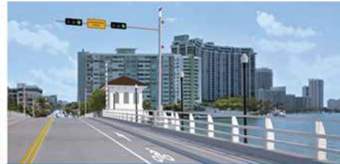
Typical Section Alternative: T2 – Wyoming Railing TL-4 at Coping