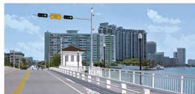
Typical Section Alternative: T4 – Wyoming Railing TL-3 at Curb and Custom Railing at Coping

Proposed alternatives developed during the study will be presented to the public at an Alternatives Public Workshop. The purpose of the workshop is to present the alternatives that have been developed for the potential replacement or rehabilitation of the bridges as well as the No-Build alternatives. The alternatives will be presented along with the corresponding initial environmental impacts, details and any relevant topics for each of the alternatives. This workshop will be a tool to disseminate project information and gather public comment and input for use in the selection of a recommended alternative. Details of the meeting are as follows: