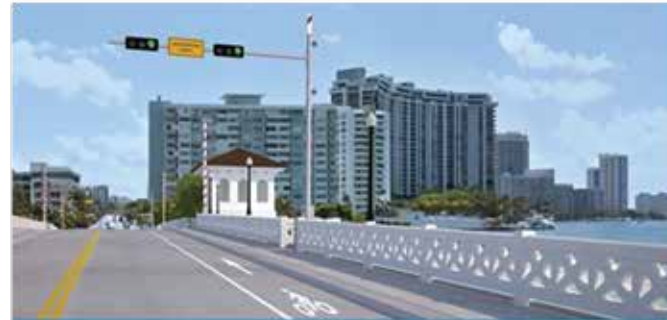
Typical Section Alternative: T1 – Venetian Railing