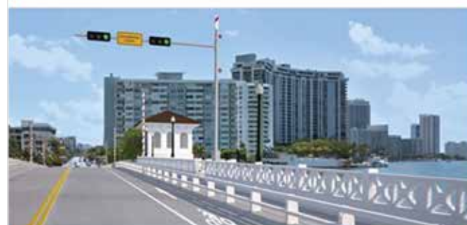
Typical Section Alternative: T3 – Wyoming Railing TL-3 at Curb and Original Venetian Railing at Coping