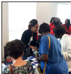
Senior community folks flock to the table after the presentation.