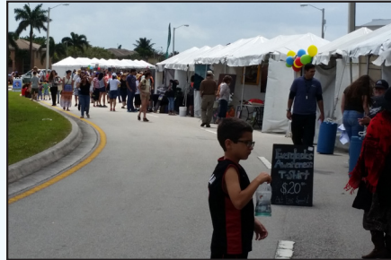
Art Fair Booth Line up.